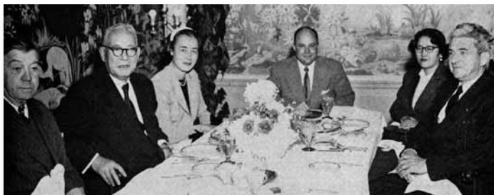
Society members entertain Admiral Kichisaburo Nomura, former Ambassador to the U.S.