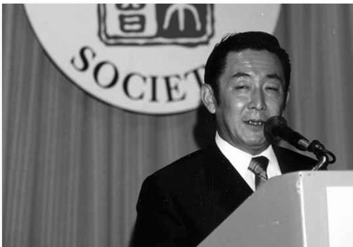
Then MITI Minister and future Prime Minister Ryutaro Hashimoto speaks on "The New Japan & U.S.-Japan Cooperation at The Biltmore Hotel, September 9, 1994.

On May 12, 1995, at the generous invitation of the Los Angeles Dodgers front office, three hundred Society members gathered to witness history as Hideo Nomo pitched his first game at Dodger Stadium; the Dodgers beat the Saint Louis Cardinals 8 to 4. Nomo was the first Japanese player to appear in Major League Baseball (MLB) since San Francisco's Masanori Murakami in 1965. Nomo also led the MLB with 236 strikeouts, started in the 1995 All-Star Game and was named MLB Rookie of the Year. Nomo's success helped open the floodgates for Japanese players and today almost every MLB team has Japanese players, much to the delight of their American fans, as well as Japanese fans both here and in Japan. Nomo's first game at Dodger Stadium is just one example of the rich and strong relationship the Society has enjoyed with the Los Angeles Dodgers.