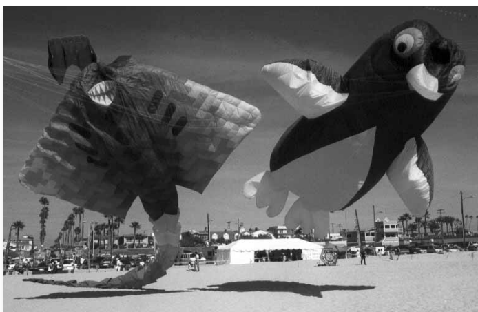
Giant kites decorate the Japan America Kite Festival®.