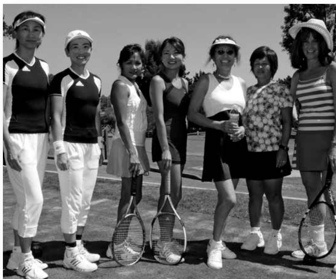
2008 Society Tennis Open at Rolling Hills Country Club.