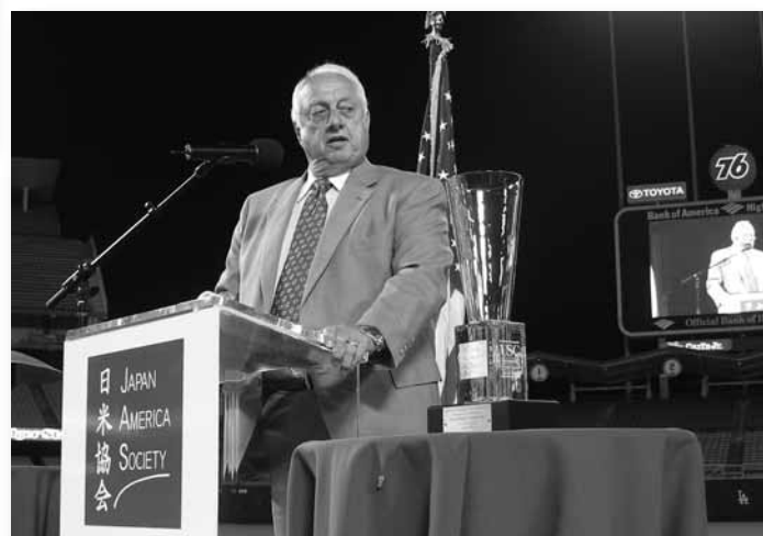
Tommy Lasorda speaks at the 96th Anniversary Dinner on the playing field of Dodger Stadium, May 11, 2005.