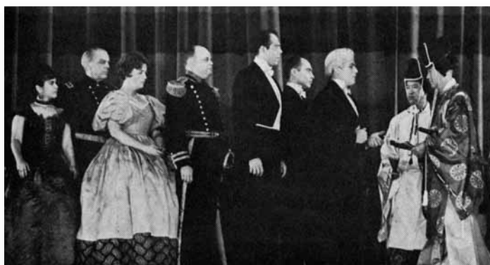
Officers of the Society and Japanese Chamber of Commerce take part in a tableau depicting President Buchanan receiving the first diplomatic mission from Japan. This was part of the 1960 Centennial observance.

Several brilliant social functions were held, including a reception for actors of the Grand Kabuki, a Japanese garden party, and receptions for U.S. Ambassador to Japan Edwin O. Reischauer and Japanese Ambassador Koichiro Asakai. However, the most successful event of the year was the luncheon and garden party held in honor of Crown Prince Akihito and Princess Michiko on September 26 at Will Rogers State Park. Nearly 1,750 people gathered on this occasion to meet Their Imperial Highnesses.