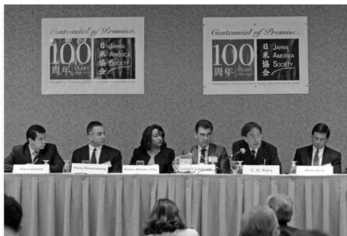
Panelists at the Third Annual U.S.-Japan Green Conference at the Holiday Inn Torrance, May 13, 2009.

With the onset of one of the worst worldwide economic crises in history, centennial preparations were made more challenging, but the board, staff and the members of the Society doubled their efforts. Simply put, the Society has weathered two world wars, the Great Depression, trade wars, "Japan Bashing" and "Japan Passing" and it will encounter unknown future challenges during the next 100 years. The Japan America Society of Southern California will continue to thrive with the spirit of its sixteen founders' motto from 1909, "Mutual Friendship - Mutual Harmony" and it will continue to serve as the West Coast's leading organization for building economic, cultural, governmental and personal relationships between the people of Japan and America.□