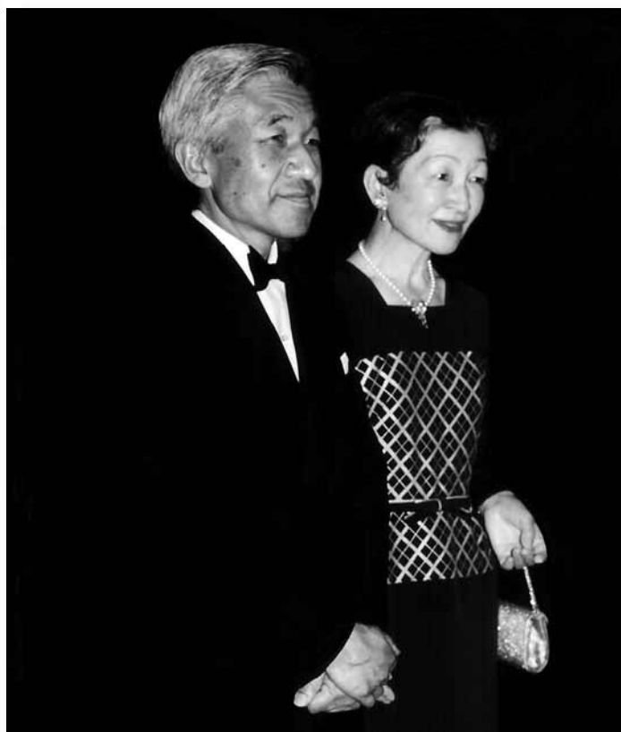
Their Majesties The Emperor and Empress of Japan are introduced and enter the ballroom of the Regent Beverly Wilshire, June 20, 1994.