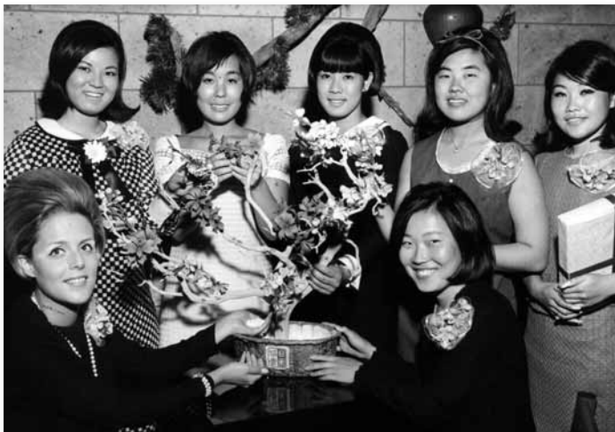
Several of The Debutantes who participated in the Second Japanese-American Debutante Ball. February 12, 1966.