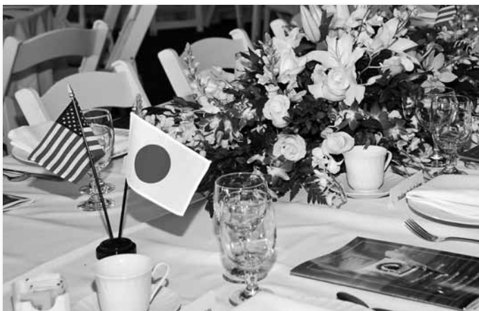
97th Anniversary Dinner Table Setting.