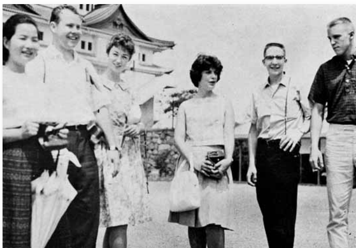
L.A. Student Mission to Nagoya in front of Nagoya Castle.