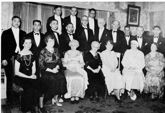
Officers of the Society, 1934.