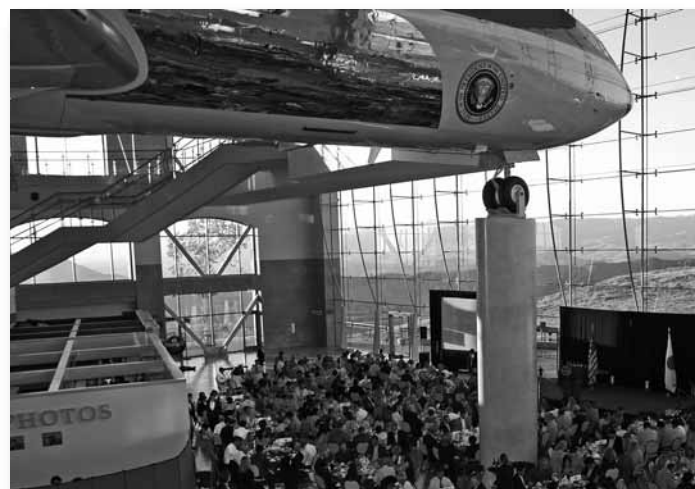
97th Anniversary Dinner, "Dining under the wings of Air Force One," July 15, 2006.