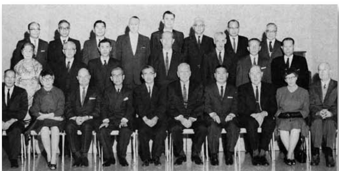
Society Council, 1961-1962.

On September 7, 1961, the Society hosted The Honorable Ryotaro Azuma, Governor of Tokyo, who spoke of Tokyo's issues as a growing city and about plans for the 1964 Olympic Games. Later that evening, the general membership was treated to a report by the Nagoya Student Mission, a group of four high school students and a chaperone from the Los Angeles City School system sent by the Society on an eleven-day goodwill tour to Nagoya. The students' trip was part of the Student Exchange Program, inaugurated by the Society in 1960, to benefit the Sister City relationship between Los Angeles and Nagoya.