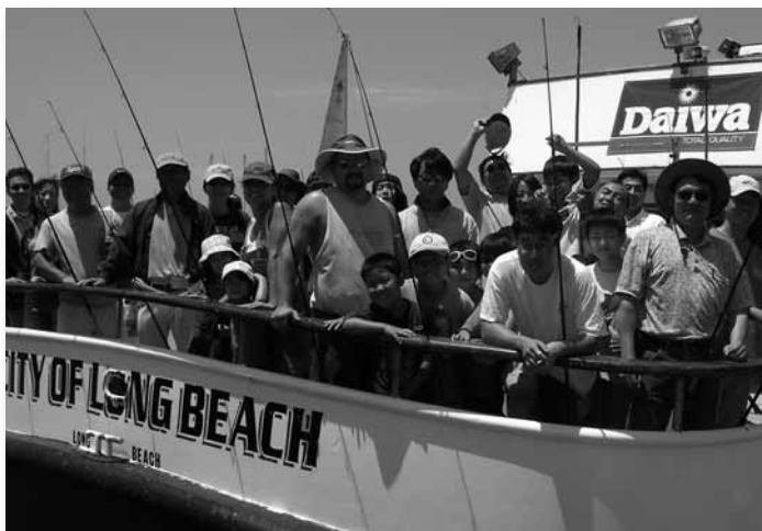
Society members aboard the “City of Long Beach” for the popular annual Family Fishing Trip.